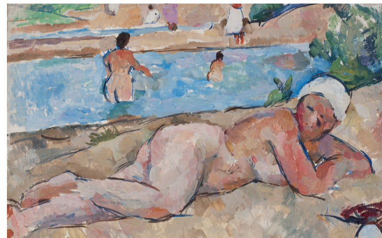
Pyotr Konchalovsky, Woman on the Bank of the River , 1922 estimate 18-24 million rubles / 390,000 - 520,000 GBP

Leonid Shishkin Gallery of Moscow is holding its most important sale of Russian art so far. The works by some of the most famous Russian artists will be presented at the auction, such as Isaak Levitan, Vasily Polenov, Konstantin Makovsky as well as stars of the Russian avant-garde Pyotr Konchalovsky, Mikhail Larionov and Alexander Shevchenko. The top-lot is a monumental work by painter from the “Jack of Diamonds” group, Pyotr Konchalovsky “ Woman on the Bank of the River ” (estimate 18–24 million rubles). This so called “Russian Cezannist” painting was executed in summer 1922, when the artist resided in Krylatskoe village by Moscow. During that period he continued working on a series of “bathings”, to which this particular work belongs. The is of excellent provenance directly from the artist’s family, it was exhibited in 1923 and was included in the monograph publication on Konchalovsky.