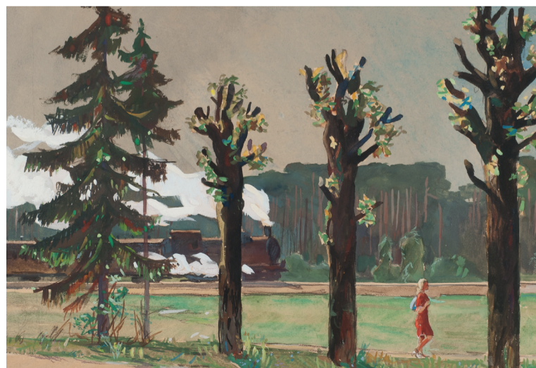
Alexander Deineka, Spring , 1948 (estimate 2.3 - 2.5 million rubles / 50,000 - 55,000 GBP)

“ The Beating of the Waves ” is dated to 1872 and was executed by the artist in Porto d’Anzio (estimate 8-10 million rubles / 173,000 - 217,000 GBP). Among the surging waves of the sea the artist depicted on the canvas the ruins of the Nero’s Palace. The painting was immediately acquired by the heir, Tsarevich Alexander Nikolaevich, future emperor Alexander III and was kept at the Tsarskoe Selo Palace. Later on, in the early 1930s, the painting among other items from the “private part” of the Alexandrovsky Palace was passed to the corporation “Hotel” and thereon sold abroad.