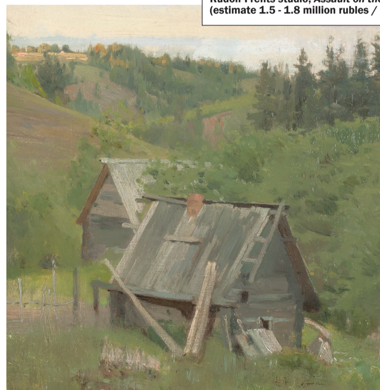
Isaak Levitan, Mill , 1988 (estimate 10-12 million rubles / 217,000 - 260,000 GBP)